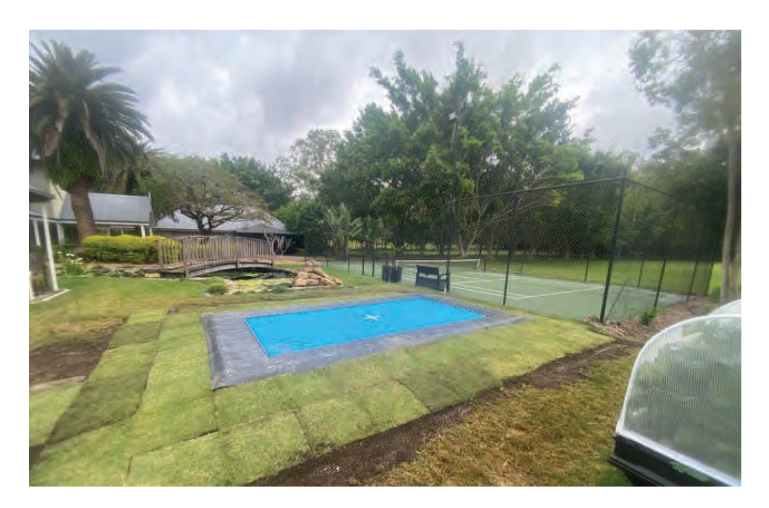
Congratulations and well done! Enjoy your new Mr. Trampoline trampoline!

Back fill the gaps around the masonry wall to ensure the trampoline is evenly at ground height. Place your rubber skirting along all for sides, the shorter sides usually sit over the top of the longer sides. The rubber should just cover the hanger clips and have about 110-120mm overhang from the outside of the frame. Place 3 screws and washers in each corner and evenly space the balance of screws along all sides of the rubber (usually every 400mm) use a string line if you want to keep the screws nice and uniform.