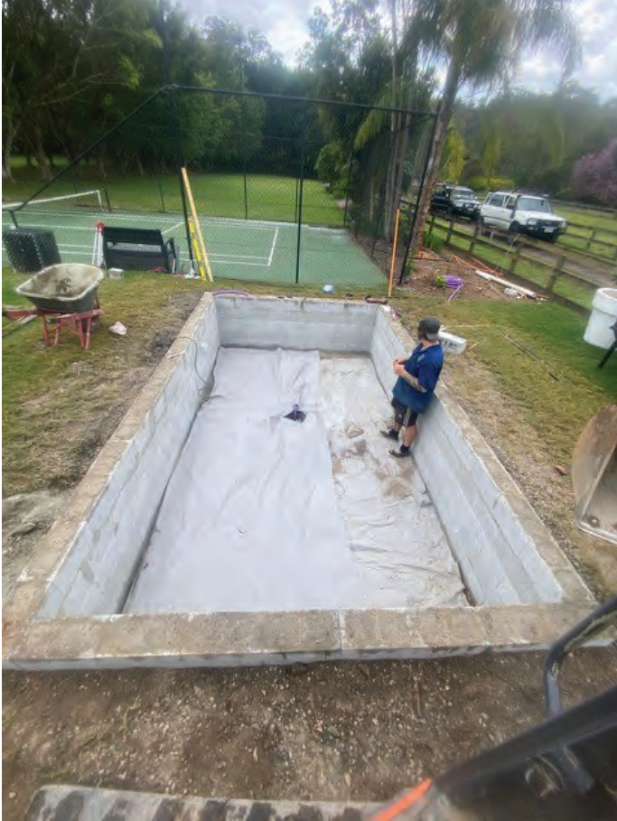
Tips: Wait for the concrete to set completely before bolting your deck model frame