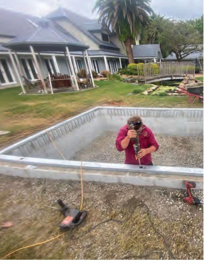
Tradesman in action bolting down the frame to the masonry walls of the pit.